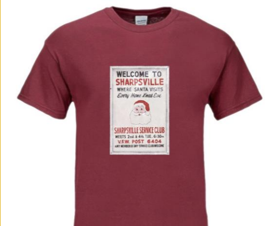
T-shirts $20 all sizes

Our Santa Collection commemorates Sharpsville's unique 76-year tradition of Santa visiting every home with a porch light on prior to Christmas. The image is from a photo of one of the original signs leading into town (taken December 1987). These signs have been replaced twice since then, though neither are as iconic as the original.