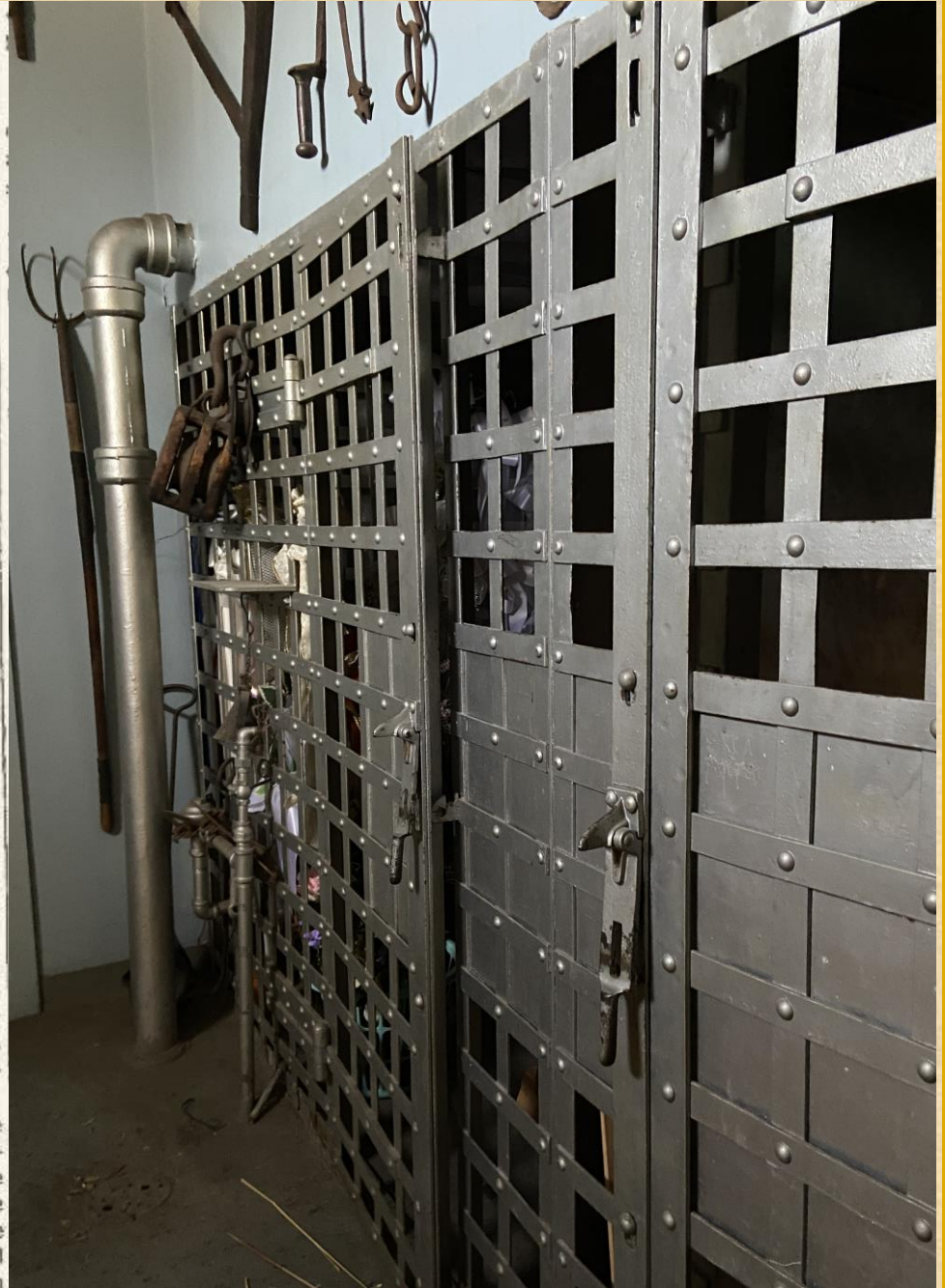
The jail still at Sharpsville Floral's building. Currently a storage room, though well-preserved (and perhaps an option to deal with late-paying customers).

Fenton is 45 years old, smooth face of dark complexion, about 5 feet 11 inches tall and weighs 175 pounds. He is a machinist by trade.