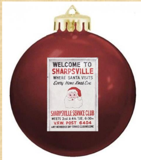
Christmas Ornament $15