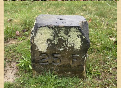
Two of the remaining boundary indexes that lie along Orangeville Road