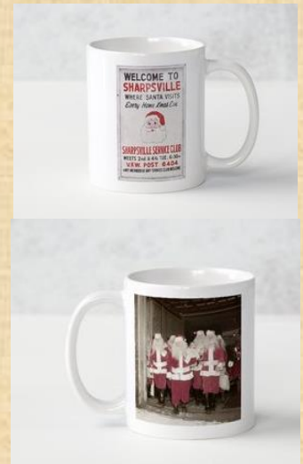
Mugs, illustrated both sides $15

We have recently received a new batch of our popular T-Shirts with a logo of the (now-departed) Kelly Road Bridge