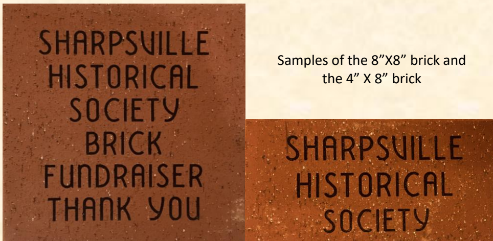
Samples of the 8"X8" brick and the 4" X 8" brick

Please consider an "In Memory of" or "In Honor of" brick for a loved one. Maybe they worked at the Shenango, maybe they are a service member stationed overseas, maybe you want to honor your parents who contributed to the town in their quiet way, maybe you want to recognize a civic organization or High School Class, or maybe you want to memorialize a Sharpsville family name.